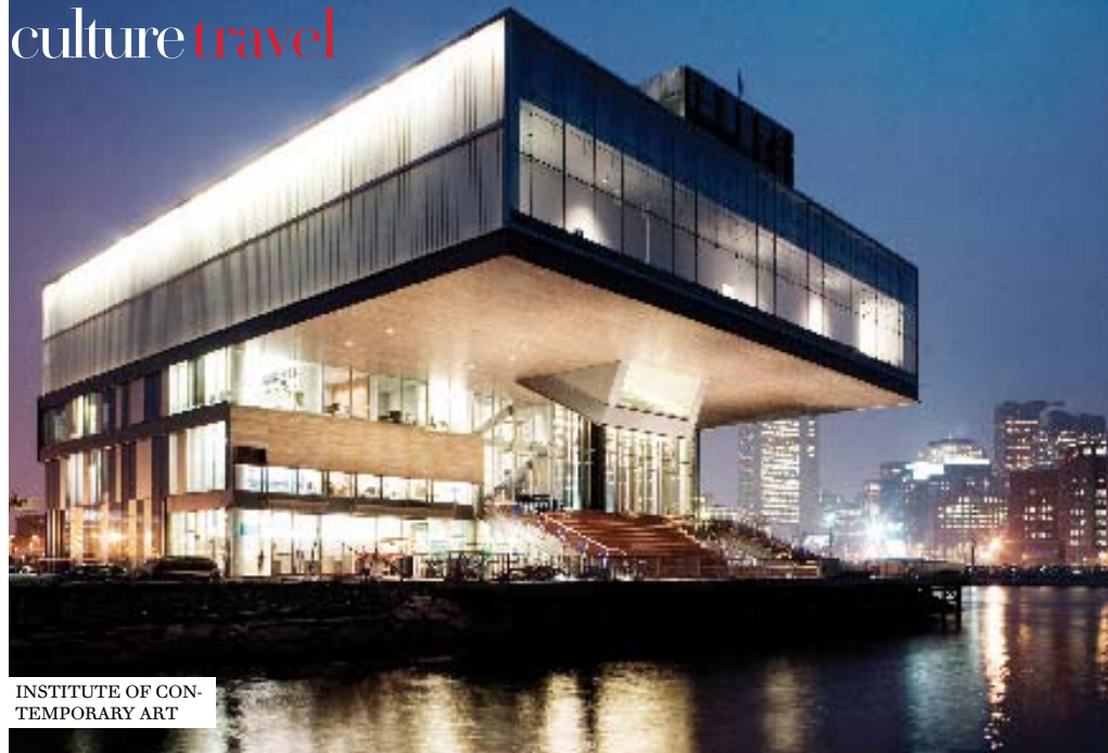
INSTITUTE OF CONTEMPORARY ART

in the über-cool Fort Point area. The “mixers” ask you to choose a liquor, then whip up a unique concoction from scratch. Down yours while nibbling on foie gras lollies, quail brochettes and quince confit. (348 Congress St., 617-695-1806, drinkfortpoint.com )