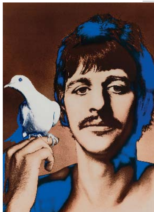
ABOVE: RINGO STARR BY RICHARD AVEDON, 1967, AT THE MUSEUM OF FINE ARTS. BELOW: THE MISS WORLD COMPETITION BY MARLENE DUMAS, 1983, AT THE INSTITUTE OF CONTEMPORARY ART

9 p.m. Commission a bespoke cocktail at Drink, a new Barbara Lynch lounge »