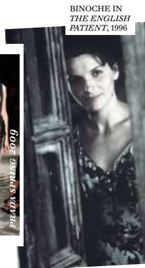
BINOCHÉ IN THE ENGLISH PATIENT, 1996